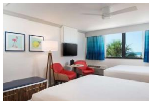
Beachfront Traditional 2 Bed Queen

Please note: Guests staying Saturday night will be responsible for the $15.00 per night Parking & WIFI fee OR the $25.00 per night Amenity fee in addition to the 13% room tax.