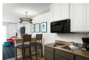
Premium Queen Studio with Kitchen & Balcony