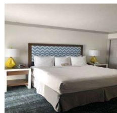
Premium King Studio with Kitchen & Balcony

Electrical Council of Florida ● P. O. Box 457 ● Land O' Lakes, Florida 34639 Phone: 813-885-9605 ● E-mail: staff@ecf-fl.org ● website: www.ecf-fl.org